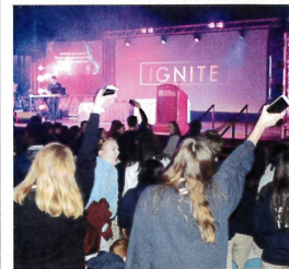
LIVE MUSIC BY ALL THINGS I AM