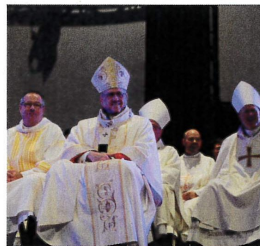
MASS WITH THE BISHOPS OF KANSAS