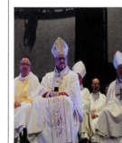
MASS WITH THE BISHOPS OF KANSAS