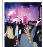
LIVE MUSIC BY ALL THINGS I AM