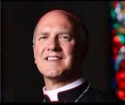
Bp. Jerry Vincke Diocese of Salina

$40 per person Includes Light Breakfast & Lunch February 21, 2026 8:30 AM - 4:00 PM St. Bernard Catholic Church Wamego, Kansas