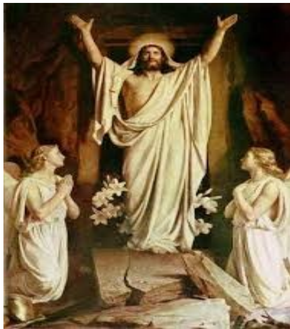
Christ Is Risen