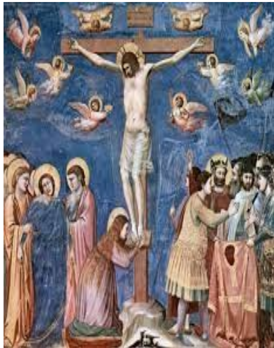
The Crucifixion of Our Lord