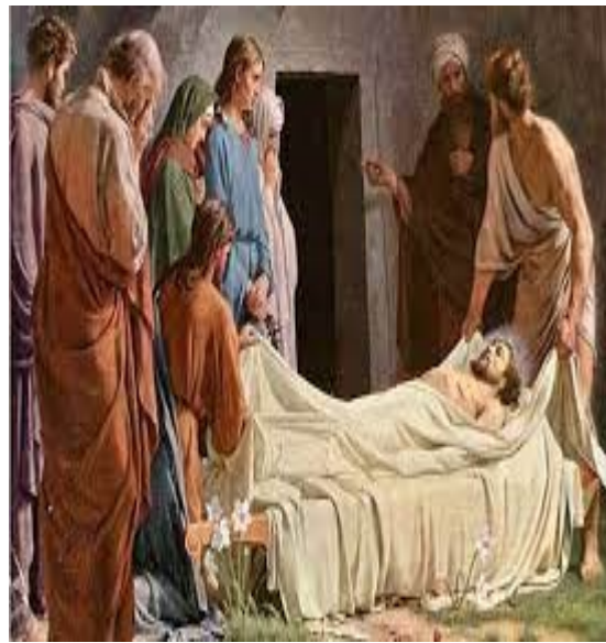
The Buriel of Jesus in the Tomb