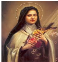
St. Therese of Lisieux's

little way shows us that we can achieve Holiness by performing even the smallest acts with great love. For the family, every day is made up of many, many small acts feeding hungry tummies, comforting a feverish child, getting a squirmy toddler dressed for Mass and in each one we have the opportunity to practice mercy and be a living example of how to love and follow God. The Corporal Works of Mommy (And Daddy, Too) gives parents practical suggestions, tips, and ideas for ways to practice the corporal works of mercy in the home, and reflection questions for delving deeper into the topics. Each chapter also includes a prayer for God's Guidance in our pursuit of the little way of the family. Let God set your family ablaze with his love when you practice The Corporal Works of Mommy (And Daddy, Too) .