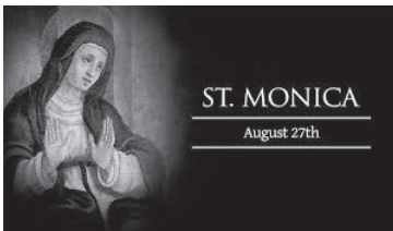
ST. MONICA August 27th