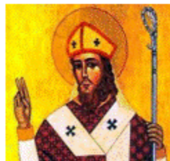
St. Hilary, January 13

Thank You, St. Stanislaus ~ Thank you to all who purchased Poinsettias for our Memorial Trees. Without your support the trees would not be possible. You may pick up your poinsettias after Mass on January 7th.