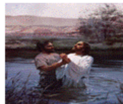
Baptism of the Lord January 8

Thank You ~ A big thank you to all who made it to the blood drive on Dec. 29th. We were within one unit of reaching our goal. Please mark your calendar for May 3rd for our next blood drive.