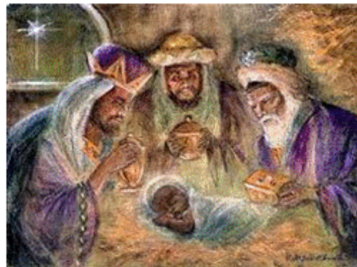
Epiphany of the Lord

Office Hours: Monday through Thursday 10:00am to Noon and 1:00 -3:00pm Friday 9:30am to 11:30am and 12:30pm- 2:30 pm