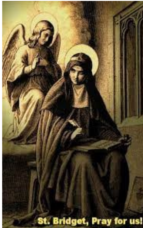
St. Bridget, Pray for us!